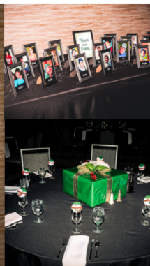
Top: Memorial Table Bottom: Tablescape